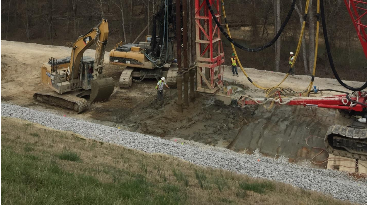
Figure 2. Deep soil mixing for shear wall installation at toe of ash pond embankment