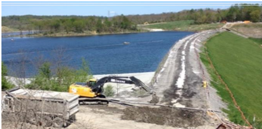
Figure 5. Self-hardening slurry trench installation in coal ash storage facility dam In Situ Soil Mixing for In Situ Stabilization / Solidification of Coal Ash (Maine)

Self hardening, cement-bentonite and slag-cement-bentonite walls, have been successfully used as hydraulic barriers for improving coal ash storage facilities numerous times. Two such examples include 1950 m 2 (21,000 ft 2 ) and 3700 m 2 (40,000 ft 2 ) walls installed to depths of 9 to 12 m. In both cases, the hydraulic cutoff walls were installed through embankments to minimize seepage and improve stability. In these applications, the self-hardening method was selected so that the cutoff wall would have an unconfined compressive strength greater than 200 kPa (30 psi) to support access roads and for stability of the structure. Project challenges included the narrow work platforms and in one case an adjacent railway that required daily coordination. Figure 5 shows the slurry trench installation at one of the sites and illustrating the narrow work platform.