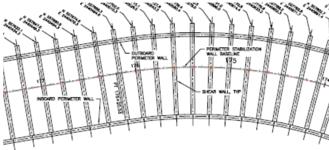
Figure 3. Typical foundation wall design layout

The shear walls were installed down to a local bedrock formation with depths ranging from 14 to 20 m. In total, the walls installed at this site have a combined length of 19 km (12 miles). The project totaled 428 m 3 (560,000 cubic yards). In units typical of vertical cutoff walls (area = length x depth), the project totaled 351,000 m 2 (3,780,000 ft 2 ) making this the largest self-hardening slurry trench installation in the US.