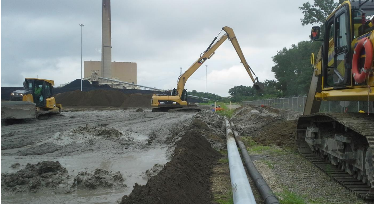
Figure 4. Soil-bentonite cutoff wall installation at coal fired power plant