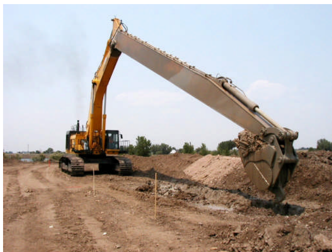
Fig. 3: Long Stick Excavator

The construction of the PRB began with a levelling of the area under the supervision of Geo-Solutions. The trench was excavated with a Komatsu PC750 hydraulic excavator with an extended stick extended to dig up to 65 ft . The bucket was 0.72 m wide and had a capacity of 0.9 m 3 . The excavation was divided into 3 panels and used bio-polymer slurry to retain the trench walls.