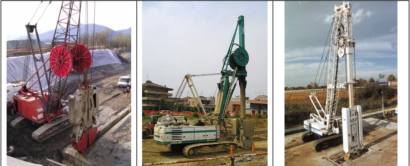
Fig. 2: Crane excavators: (a) Rope suspended; (b) Kelly mounted; (c) Hybrid system.

In the following paragraph two similar case studies are presented to compare merits of the presented excavation techniques.